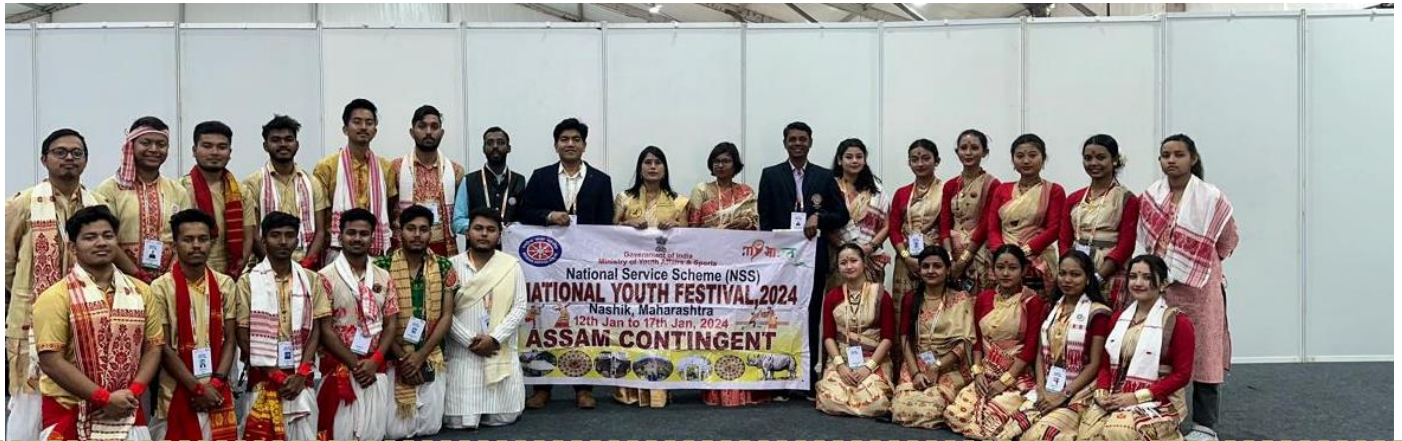
NSS Program Officer of this college represented as Contingent Leader of NSS Assam in National Youth Festival 2024, Nashik, Maharashtra