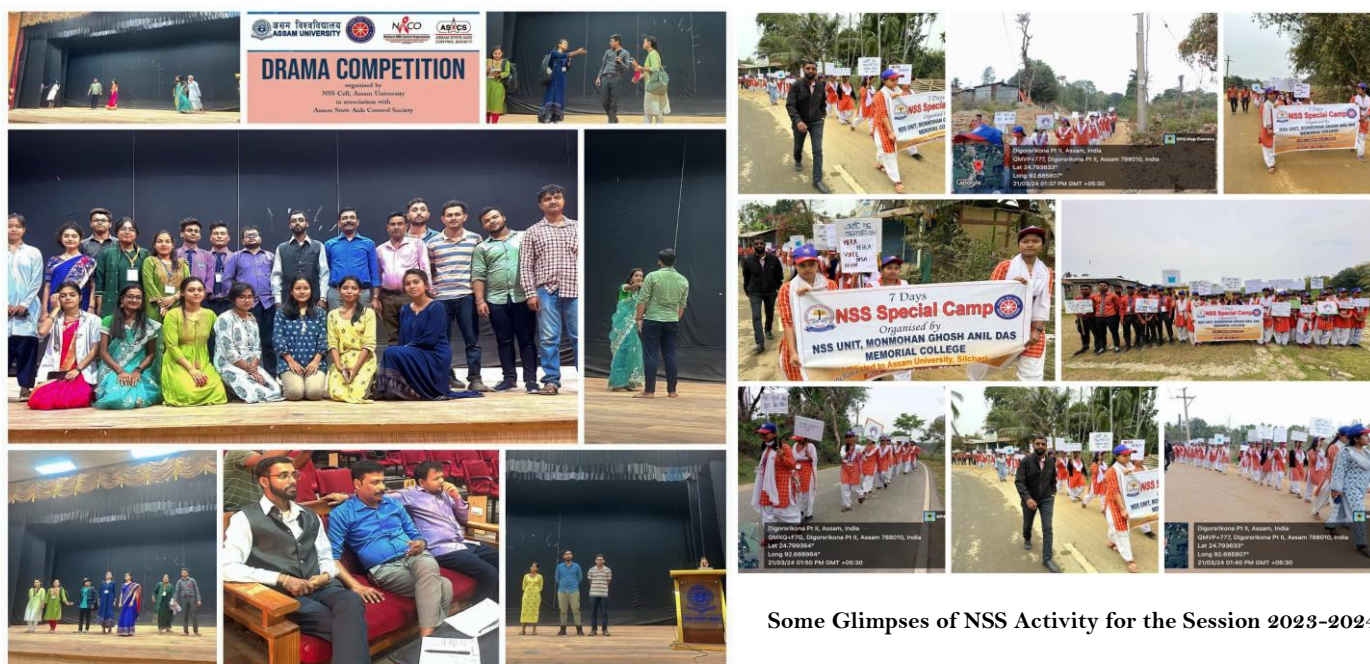
Some Glimpses of NSS Activity for the Session 2023-2024